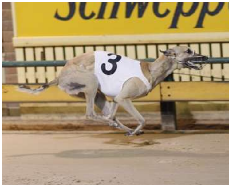
Miss Brook an easy winner of the Dillon Memorial

Mid City Mandy hung on for second, while perennial Group finalist Rocky ($3.70) railed strongly to finish third, a further length away. Rocky ran third in the 2005 running of the race, and has now competed in 17 Group race finals.