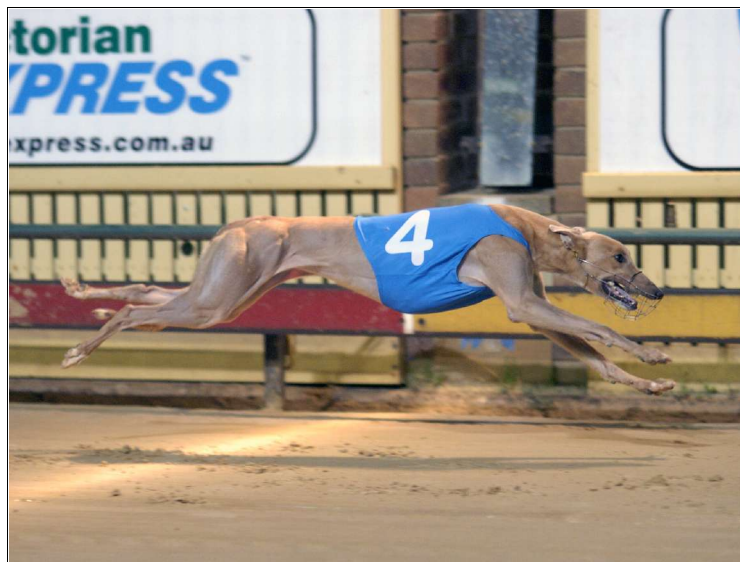
Last Year's Adelaide Cup winner Miss Spicy

1972 Bristol Miss , 1973 Valjuka , 1974 Bristol Sue , 1975 Turn Pillage , 1976 Golden Spur , 1977 Cavalier Queen , 1978 Riviera Tiger , 1979 Encanto , 1980 Youthful Prince , 1981 Lady Tornquest , 1982 Smithy's Belle , 1983 Superstar , 1984 Knocklaun Gold , 1985 Thundering Two , 1986 Farquhar , 1987 Club Edition , 1988 High Wonder , 1989 Kuriarkin , 1990 Sandi's Me Mum , 1991 Highly Blessed , 1992 South Road Sid , 1993 Croatian Star , 1994 Perplexed , 1995 Forest Fin , 1996 Jurassic Vapour , 1997 Rare Deceit , 1998 Rapid Journey , 1999 Young Harrison , 2000 Jack Junior , 2001 Brett Lee , 2002 Brookside Bear , 2003 Waterview Star , 2004 Hotline Hero , 2005 Collide , 2006 Miss Spicy .