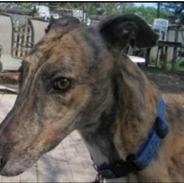
Pepes Dilemma * IE/US-MAR-94-BK