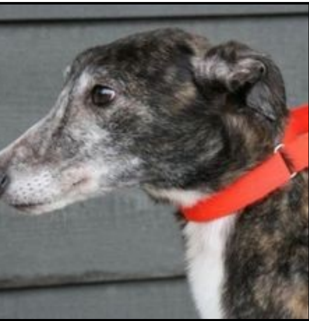
PA's Apocalypse US-AUG-98-DKBD