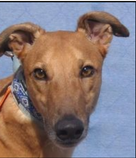
Flying Hydrogen US-OCT-03-F