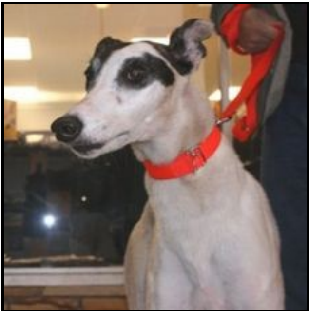
JNB Flash Back US-FEB-98-RBD