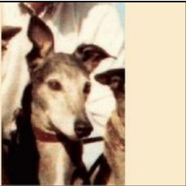
Talk of the Town US-JAN-71-RW