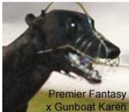
Premier Fantasy x Gunboat Karen