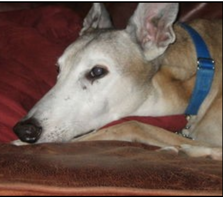
Magic Gangster US-SEP-92-F