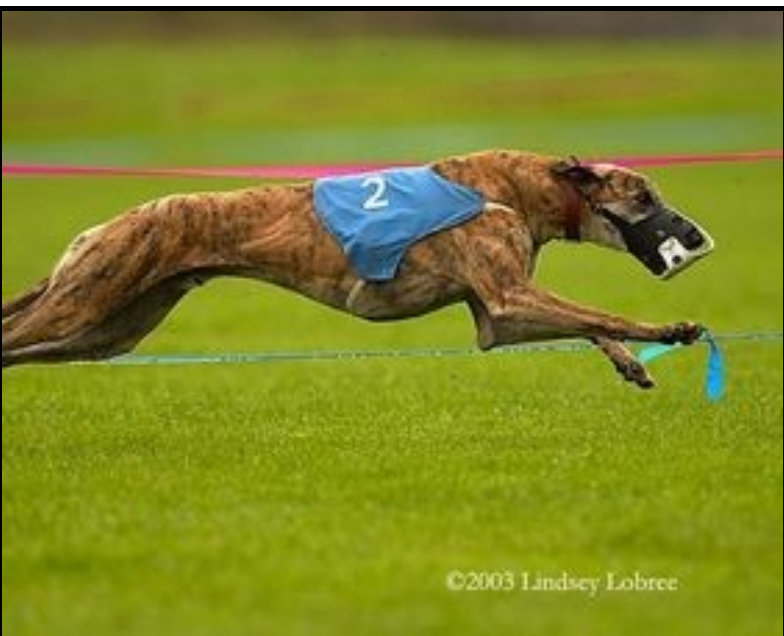
Red Dog US/CA-JUN-89-R