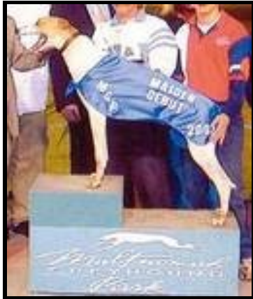
Yukon Kasey US-NOV-95-BD