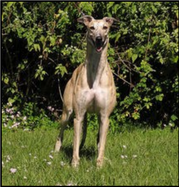
Beams Full Moon US-OCT-95-RBD