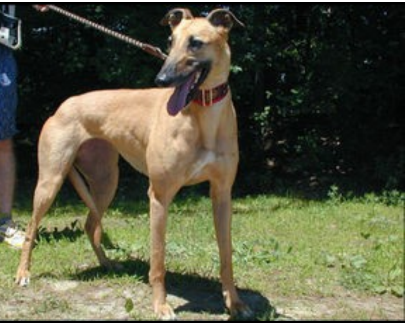
Our Pacer US-MAY-95-BD