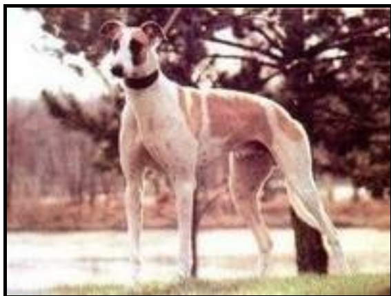
Hairless Joe US-JUN-77-BD