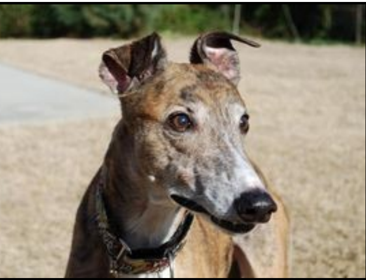
Trojan Episode US-AUG-89-WRF