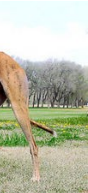
Kiowa Sweet Trey US-JAN-00-RBD